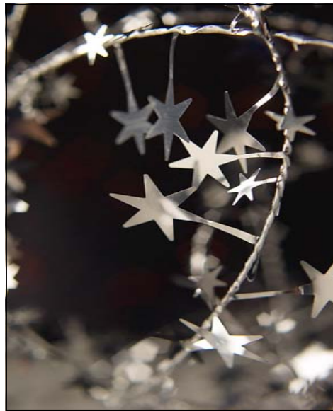
December 3, 2013 TBA