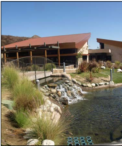
October 1, 2013 Oak Park Community Center & Gardens Oak Park