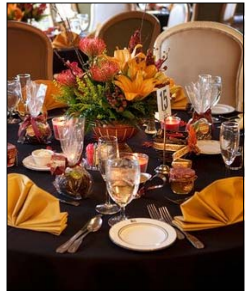
February 4, 2014 Las Posas Country Club Camarillo